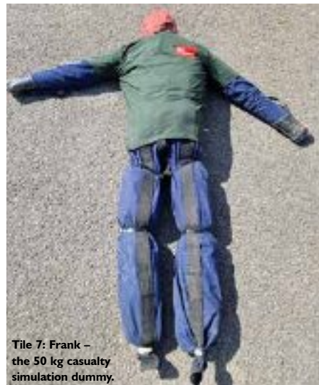
Tile 7: Frank – the 50 kg casualty simulation dummy.