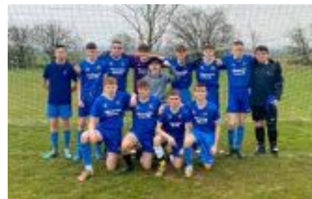
The Winning Year 11 Team.