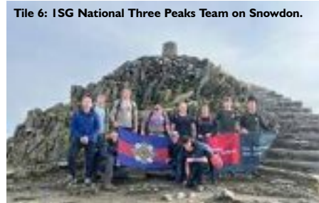
Tile 6: ISG National Three Peaks Team on Snowdon.