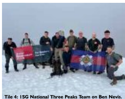
Tile 4: ISG National Three Peaks Team on Ben Nevis.