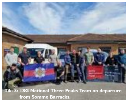
Tile 3: ISG National Three Peaks Team on departure from Somme Barracks.

As conquering the National Three Peaks in itself was considered 'tame' by the team, they also took 'Frank' with them. Frank is a 50kg casualty simulation dummy, literally a dead weight! For those soldiers of a certain generation, the irony of Frank is probably not lost. Often seen abseiling, skiing, and skydiving, Frank was a central character in the British Army advertising campaigns of the early nineties.