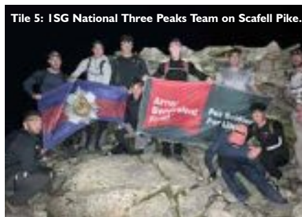
Tile 5: ISG National Three Peaks Team on Scafell Pike.